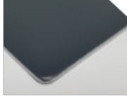
ULTRASURE Solid Colours