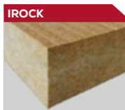
AS 1530.1 Insulation