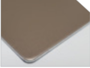
ULTRASURE Metallic Colours