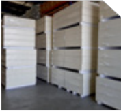
IBOARD PIR Insulation