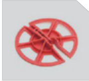
IBOARD Cavity Retainer Clips