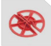
IMAX Cavity Retainer Clips