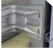
IROCK + BICEP Vertical System