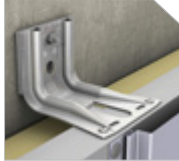
IROCK + BICEP Horizontal System