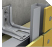
IROCK + BICEP Visible-fix System